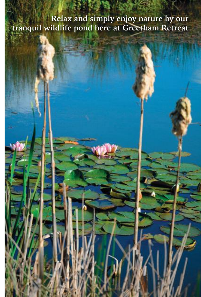
Relax and simply enjoy nature by our tranquil wildlife pond here at Greetham Retreat