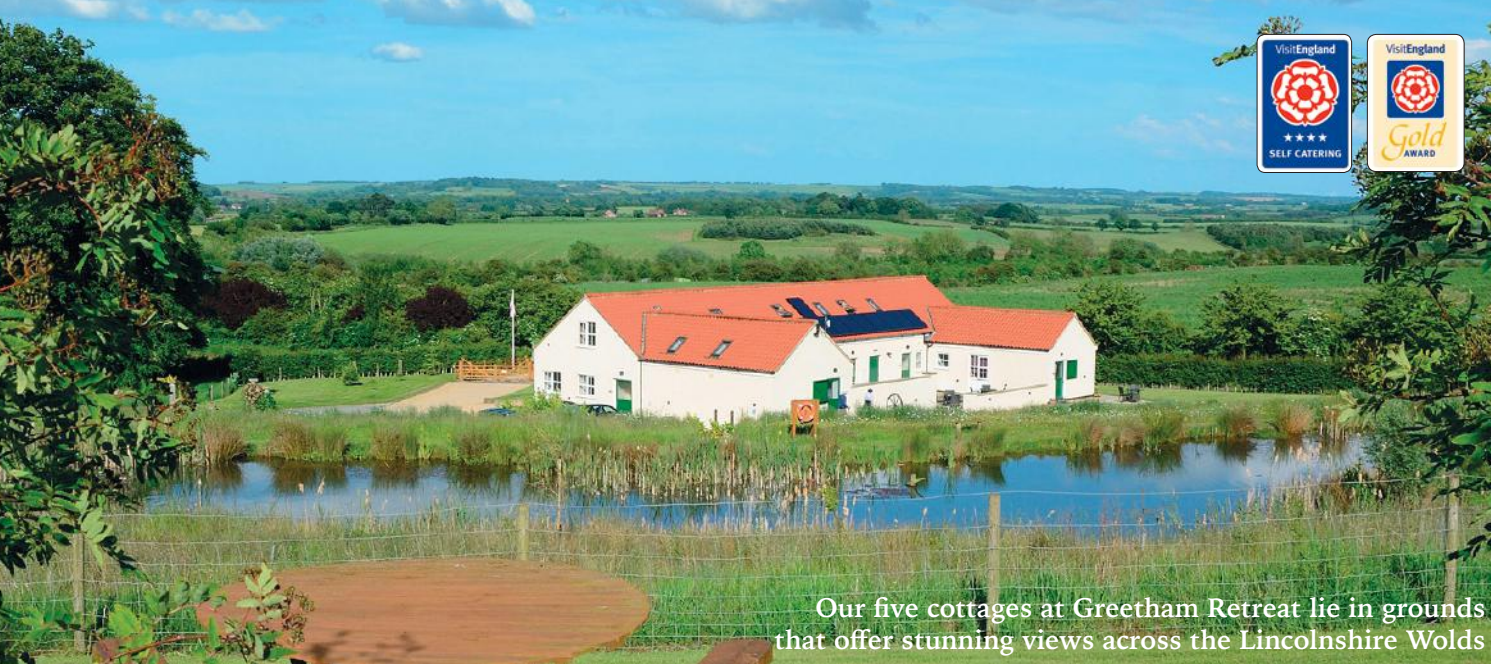
Our five cottages at Greetham Retreat lie in grounds that offer stunning views across the Lincolnshire Wolds

G reetham Retreat provides an idyllic rural escape for short breaks or longer holidays all year round.