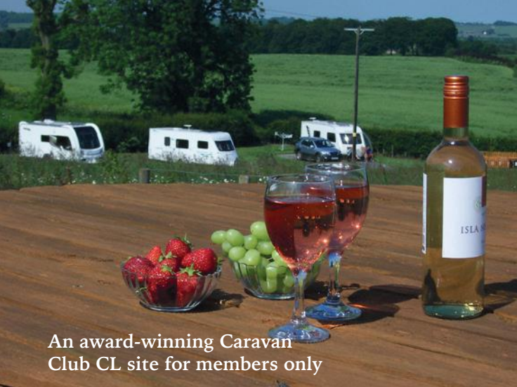
An award-winning Caravan Club CL site for members only

Greetham Retreat has an exclusive, members only, Caravan Club Certificated Location (CL) for just five touring caravans or motorhomes. The site is tranquil, spacious and peaceful with all modern facilities, making it ideal for those who want a relaxing getaway in the Lincolnshire Wolds. Well-behaved pets are most welcome.